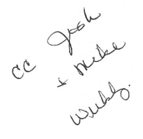
Board Member, CAHA 28 October 2019